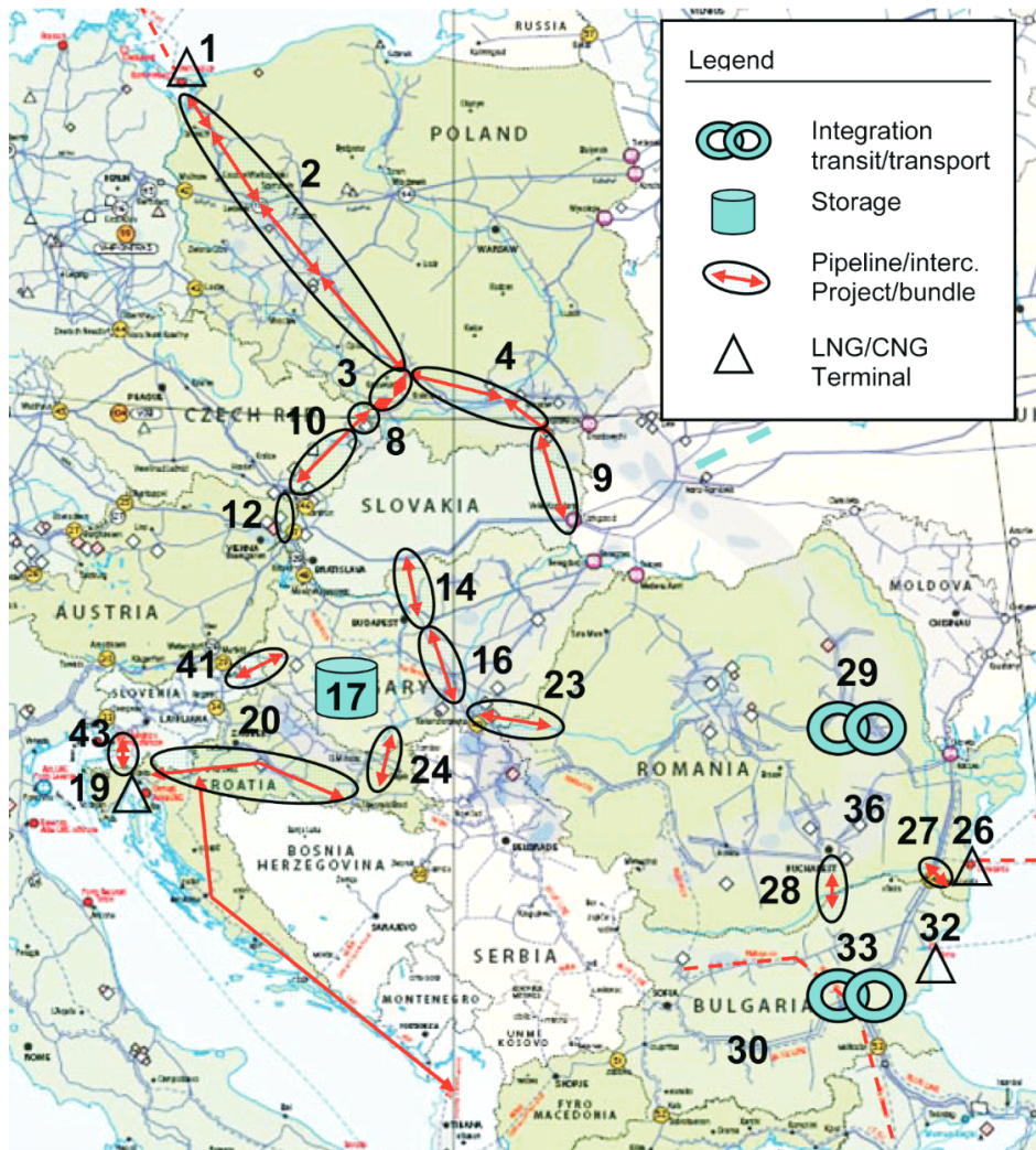
Map 1. North-South Gas Corridor