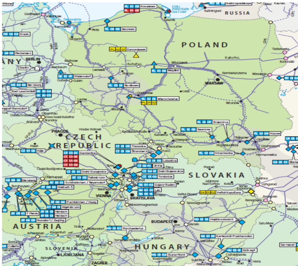
Fig. 2. UGSF of Poland, Hungary, Czech Republic and Slovakia

At the same time, all Slovak gas storage facilities are located in the same region. It is the highest concentration of available UGSF capacity in a country in one place compared to other Visegrad Group countries. Such concentration of storage facilities in one region is in this case conducive to supplying gas to the market (distribution of industrial infrastructure) and safe in case of terrorist attacks. Obviously, such distribution is also connected with geological conditions. It is no coincidence that the only UGSF in central Czechia is located in a system of tunnels carved out in rock.